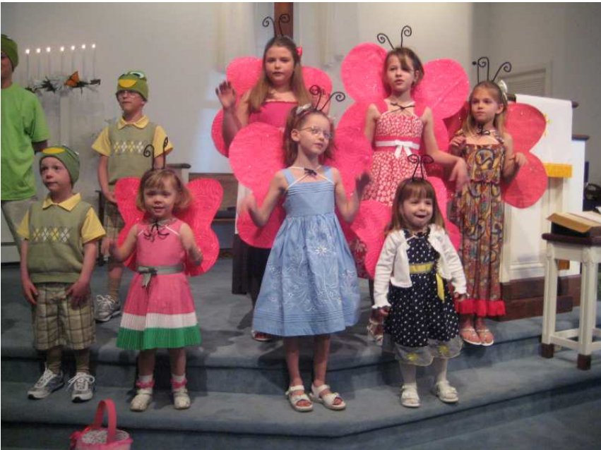
Our Children performing Bullfrogs and Butterflies in Easter Service