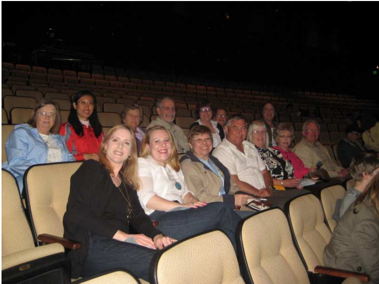
Our Outing to the African Children's Concert